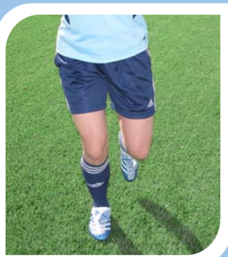
KNEE POSITION CORRECT

Jog 4-5 steps, then plant on the outside leg and cut to change direction. Accelerate and sprint 5-7 steps at high speed (80-90% maximum pace) before you decelerate and do a new plant & cut. Do not let your knee buckle inwards. Repeat the exercise until you reach the other side, then jog back. 2 sets