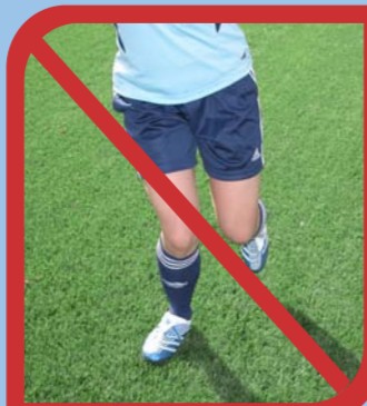
KNEE POSITION INCORRECT